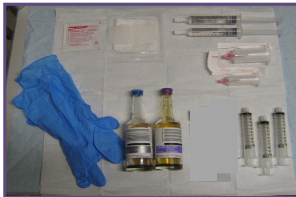
Equipment for taking blood cultures from a CVAD