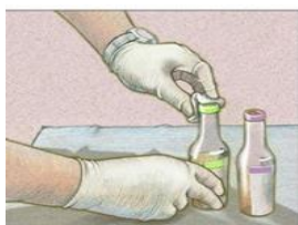
Figure 2 scrub rubber bungs