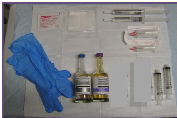
Equipment for taking blood cultures from a CVAD