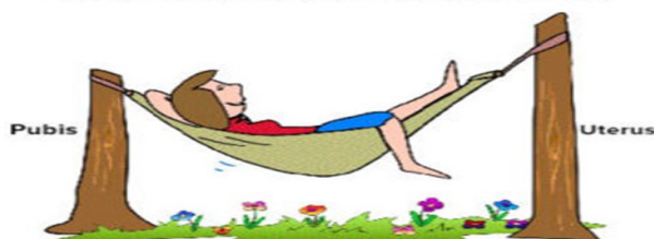
The pelvic floor acts like a hammock