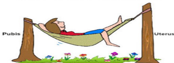
The pelvic floor acts like a hammock